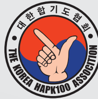
Korea Hapkido Federation